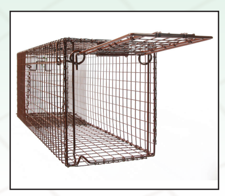
Model # 30-LTD

Our most popular trap, the 30 Light Duty Deluxe, is perfect for capturing feral cats, kittens and other small animals.