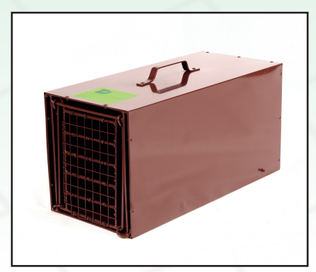
Model # R-24

Our most popular trap, the 30 Light Duty Deluxe, is perfect for capturing feral cats, kittens and other small animals.