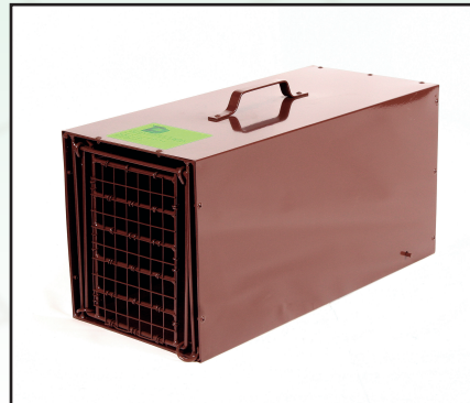
Model # R-24

Our most popular trap, the 30 Light Duty Deluxe, is perfect for capturing feral cats, kittens and other small animals.