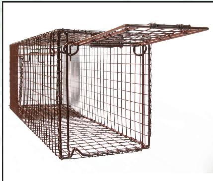
Model # 30-LTD

Our most popular trap, the 30 Light Duty Deluxe, is perfect for capturing feral cats, kittens and other small animals.