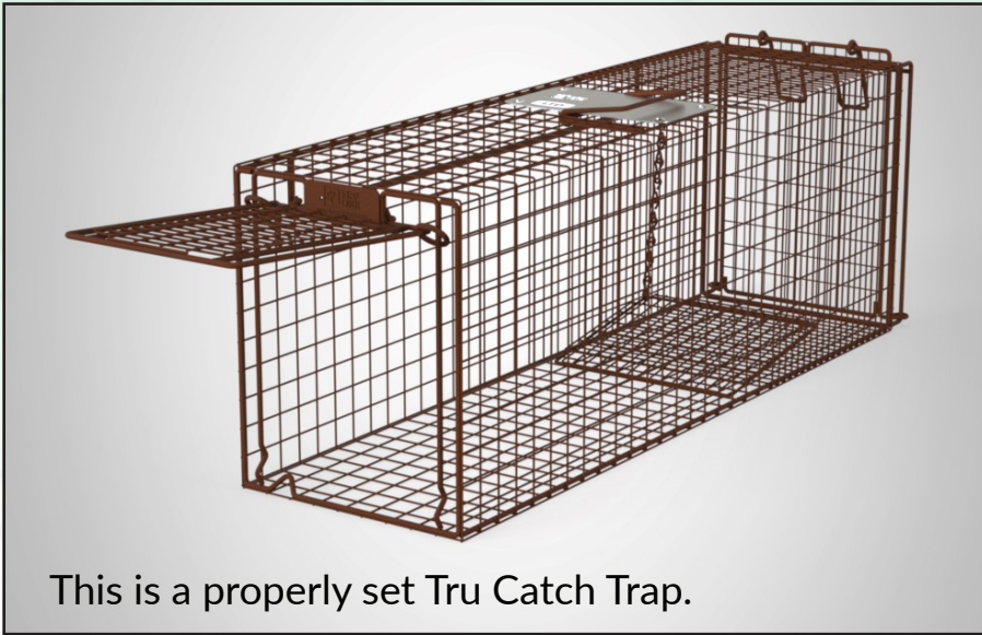
This is a properly set Tru Catch Trap.

The following Instructions apply to all Tru Catch Models